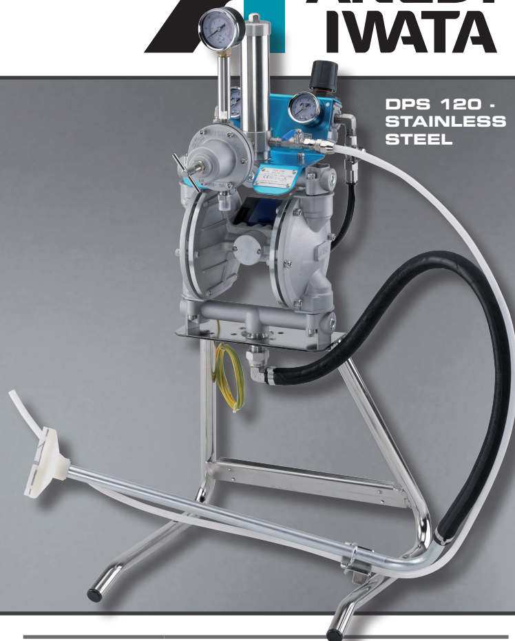
DPS 120 - STAINLESS STEEL

With a low pressure kit from Anest Iwata you get the right equipment for your needs at a reasonable price.